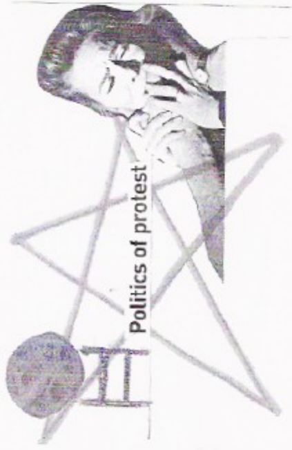
Politics of protest

11. MEN WERE FORCED INTO ENSLAVEMENT OF WORK. LIFE WAS DICTATED BY THE ECONOMY.